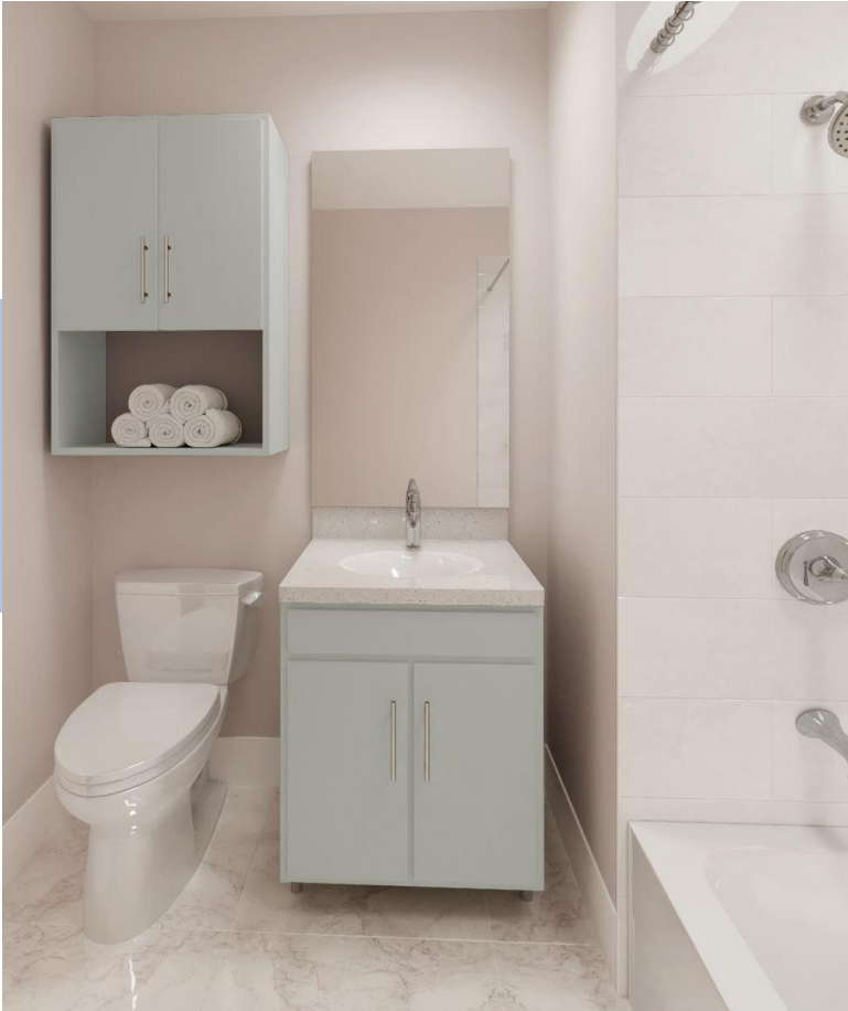
Basic Bathroom Render

Model Apartments Tours Took Place on 10/30 & 11/6