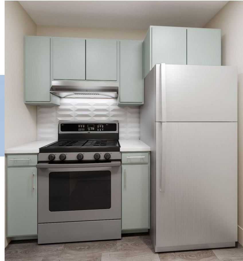
Basic Kitchen Render