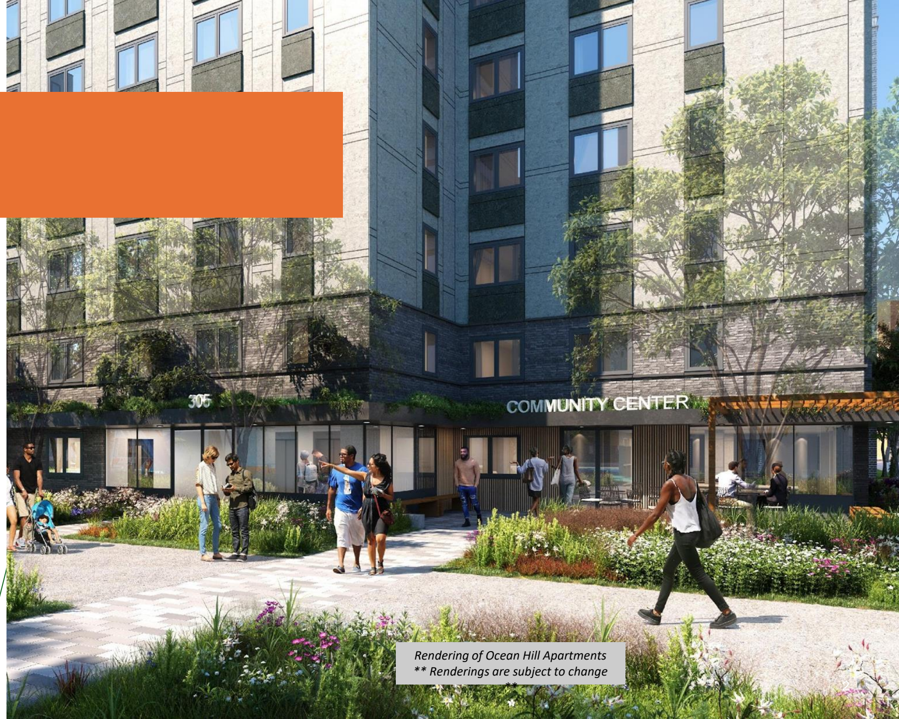
Rendering of Ocean Hill Apartments ** Renderings are subject to change